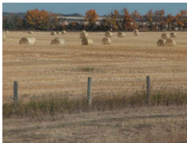
A Canadian prairie harvest